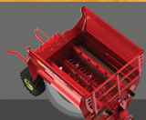
CFR 960 Bale Pro®